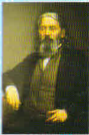
C. Hering (1800 - 1880)