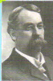
J. T. Kent (1849 - 1916)